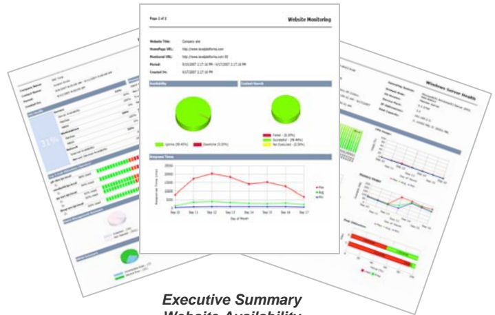
Web-based Central Dashboard