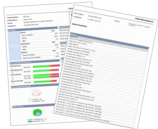
Patch Status Detail Server Health Report